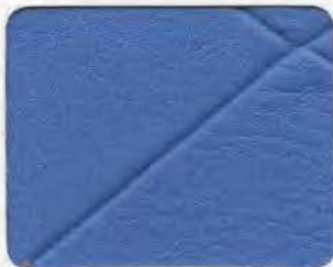
Bruin Blue CTP-902