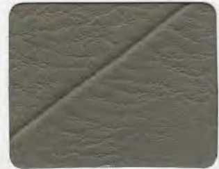
Antique Taupe CTP-511