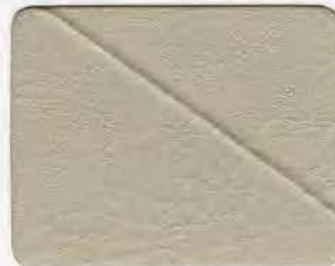
Sand Dollar CTP-903