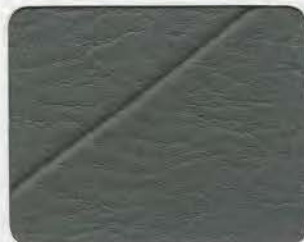
Trolley Grey CTP-510