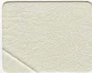
Almond Cream CTP-904