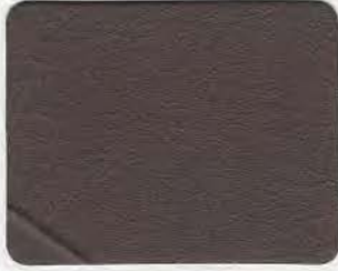
Dark Cherry CTP-512