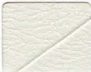
Off White CTP-905